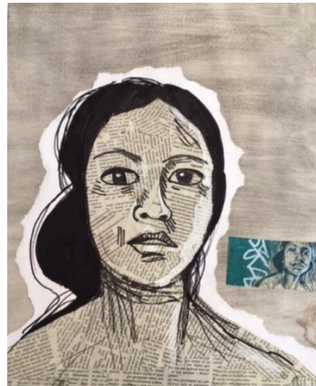
Face by Tyler